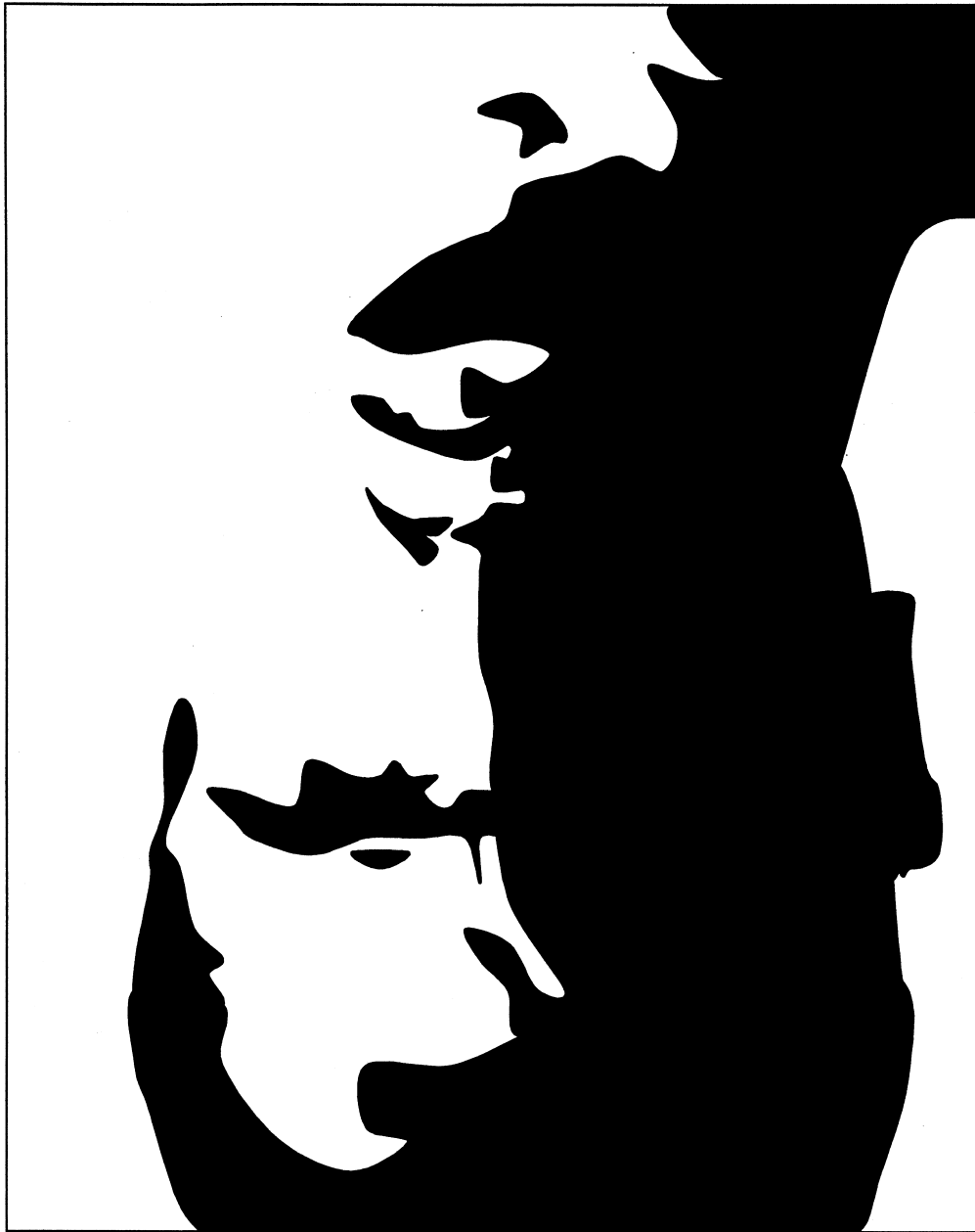
Figure 3. An upside-down Mooney face. When rotated through 180 degrees, a face can be seen.

hanced processing of local features or an inability to filter out information in the absence of explicit instruction to attend to a particular level. According to our hypothesis, this results from the failure of the binding together of local features. The second factor is a difficulty in voluntarily switching attention between the