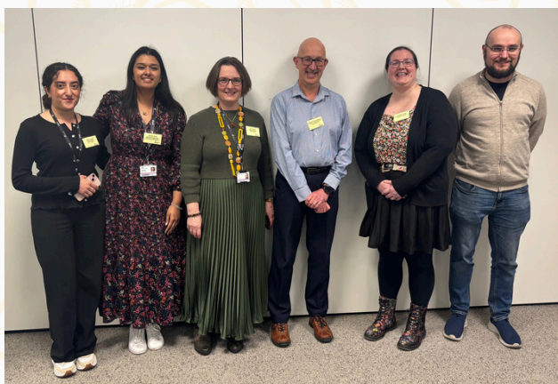
The RESOLVE team at Conference Aston

We look forward to collaborating with NHS Trusts and other organisations and seeing what the future holds for the development of strategies and pathways for preventing weight gain associated with antipsychotics. We will keep you posted on our progress with this in further newsletter issues!