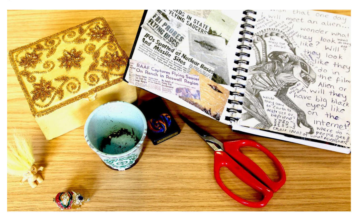
Figure 1. Contents of Nazia's identity box drawing on artefacts from childhood

Nazia, a student-teacher of mixed Pakistani/white English heritage, saw the framing of the research environment as being an act of 'sharing... in a mutually respectful circle of individuals'. Nazia's objects included: a small elephant (a pillbox); a Zippo lighter – engraved with Peace, Love and Happiness ; gardening scissors; a childhood toy; a small self-decorated plant pot; and an art book. Below, we provide commentary for two of the objects.