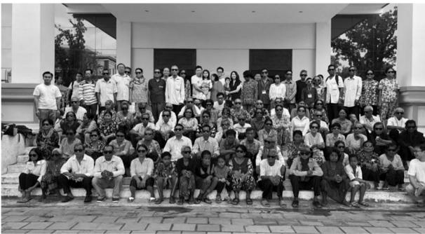
Fig. 3 Post-operative patients at the end of the day with their sunglasses.

grateful and love their free post-operative sunglasses as shown in Fig. 3.