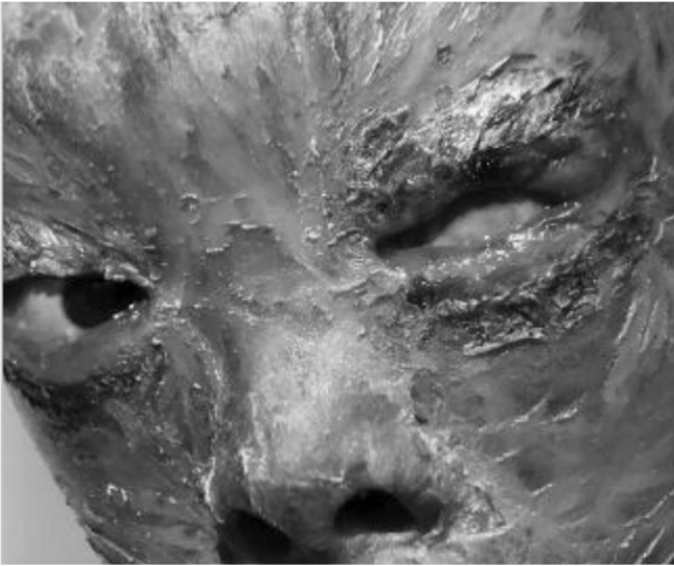
Fig. 7 Little boy with congenital ichthyosis.

sent with one parent as the other parent had to stay in Cambodia with their other children. They had never left their village before and suddenly they were sent to a completely different country with a different language and culture. The children were in Brisbane for three months. Both of these children have done extremely well.