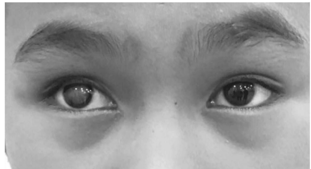
Fig. 9 11 year-old girl with a dense white cataract.

social services had to be contacted to protect the child from any harm. Delivering this sort of news to parents, via a translator and in a completely different cultural context, requires a lot of gentleness despite the buzz and extreme busyness of the clinic.