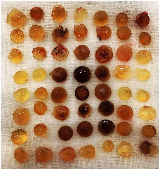
Fig. 13 The output from one surgeon performing small incision cataract surgery in a single day.

undertake work that is not typical of their day-to-day hospital activities. So much so that it is not thought of as 'work' even though the numbers of patients being operated on is far in excess of what they are used to at home.