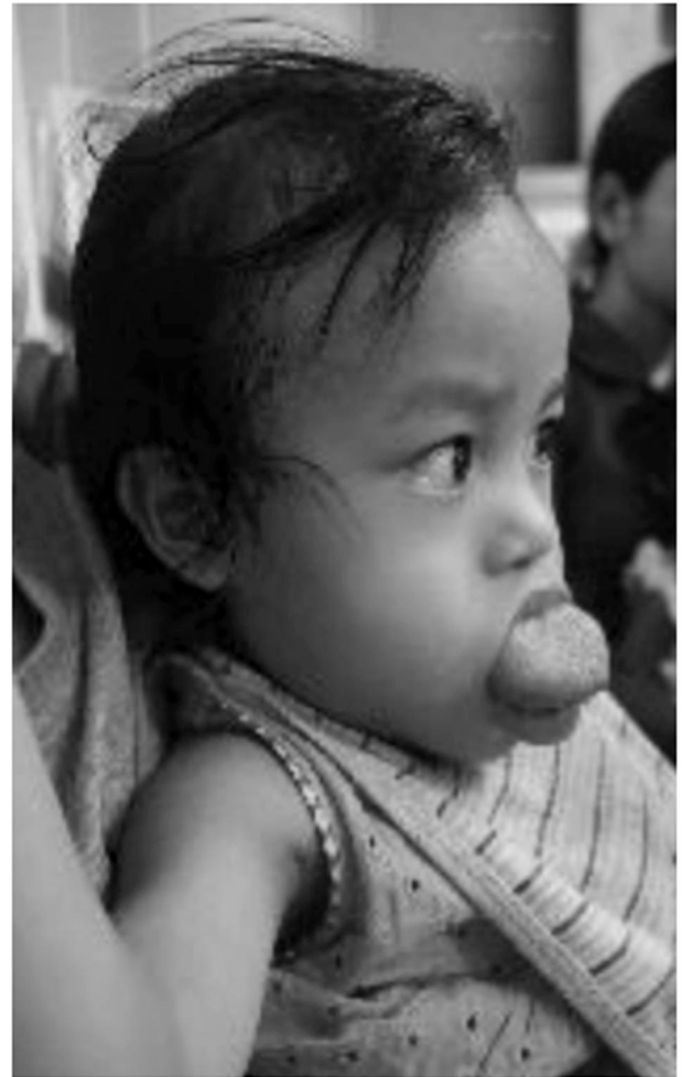
Fig. 8 Vascular malformation of the tongue.

During this same clinic, a mother brought her newborn child to the KSF clinic. The mother told us that the baby had not opened her eyes since birth. On examination this was because the baby was bilaterally anophthalmic. This case was very difficult - having to explain to the mother that her newborn would never see. Sadly, due to cases of infanticide related to congenital defects,