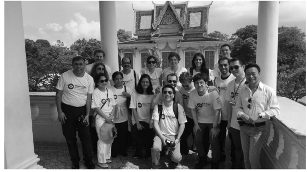
Fig. 4 The team on a tour of the palace with Prince Tesso of Cambodia.

As ophthalmologists, any management of this condition is well beyond our scope. However, KSF arranged a CT scan to be performed locally. As these cases were too risky for Cambodian hospital care, the charity undertook separate fundraising for them