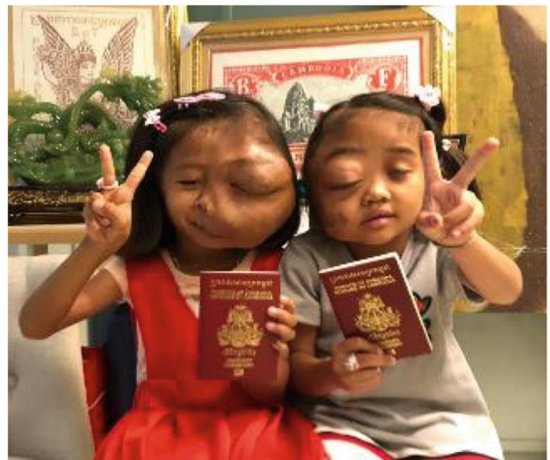
Fig. 6 Two girls with severe neurofibromatosis.

and managed to secure passports to fly the patients to Brisbane for treatment.