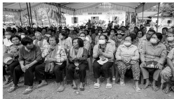
Fig. 1 Local screening sessions held in a remote village.

The screening team consists of local volunteers - students from international schools and one of the Cambodian universities (University of Puthisastra) which encourages their medical, pharmacy and nursing staff to volunteer. Volunteers also act as