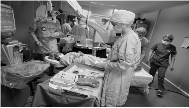
Fig. 2 Multiple operating tables running at once.