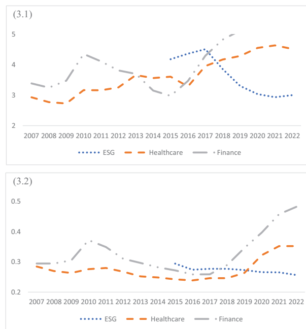
FIGURE 3 Time-varying spillover risk: (rolling) expected co-crash indicators and co-crash probabilities for environmental, social, and governance (ESG), healthcare, and finance exchange-traded funds (ETFs): (3.1 and 3.2) expected joint crashes ( 1 < E < 10 ).

The time-varying systemic risk of expected co-crash indicators and co-crash probabilities are depicted in Figure 3 for ESG, healthcare, and financial ETFs. Similar to tail- \beta s, the 7-year rolling spillover risk measurement in healthcare ETFs is much higher than the full sample. For example, when one healthcare ETF is in distress for a 7-year rolling period, 2.894356 healthcare ETFs are, on average, likely to be in distress, compared to only 0.164097 for the full sample (see Figure 3(3.1)). We also find that all three ETF categories exhibit a similar pattern of time-varying spillover risk, but financial ETFs have a more pronounced effect. Considering the distress of one financial ETF in 2019, the crash likelihood for financial ETFs is the highest, with 4.83 likely to be in distress. Assuming that one financial ETF crashed in 2015, the lowest crash likelihood would indicate a 2.98 financial ETFs crash. The likelihood of financial ETFs collapsing has increased to almost the highest level compared with ESG and healthcare ETFs since 2017. Interestingly, since 2017, the crash likelihood for ESG ETFs has declined