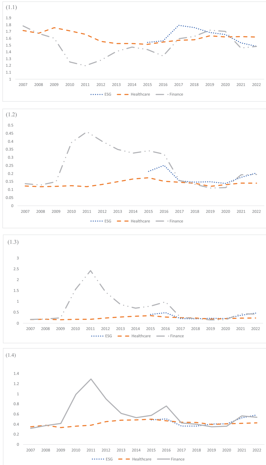
FIGURE 1 The rolling tail risk of environmental, social, and governance (ESG), healthcare, and financial exchange-traded funds (ETFs): (1.1) rolling tail index of ESG, healthcare and financial ETFs; (1.2) rolling tail quantile of ESG, healthcare, and financial ETFs; (1.3) rolling expected shortfall of ESG, healthcare, and financial ETFs; (1.4) rolling expected shortfall conditional upon 25% threshold of ESG, healthcare, and financial ETFs.