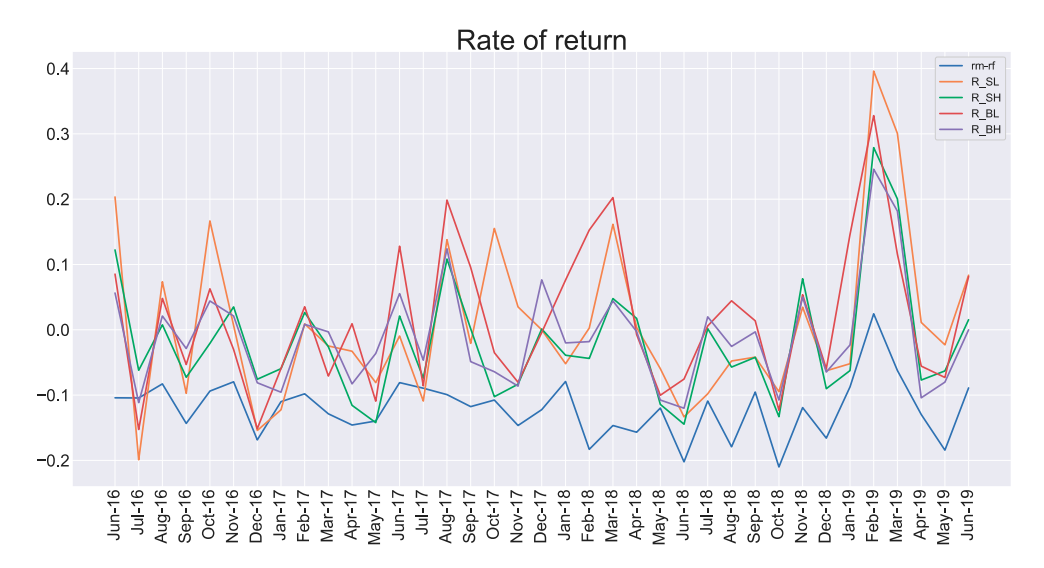
Figure 1. Tendencies of return rate of four portfolios and market risk factor.

Generally, the trend of market risk factors is the same as the trend of the average return of the four portfolios. Among them, the market risk factor better reflects the changing direction of the S/H, B/H portfolio. Changes in other combinations can also be presented, but there will be some discrepancies in specific periods. The portfolio S/L and B/L excess market factored a lot during the period from February 2018 to April 2018. This showed that the market risk factor was one of the essential variables to explain the difference in stock returns, but it was not enough to rely on the market risk factor alone to explain the changes. This also reflected the defects of the CAPM model from the side, as shown in Figure 1.