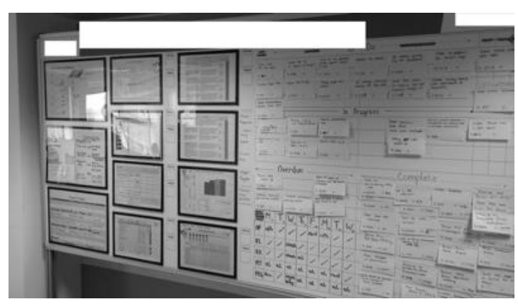
Figure 2: A Type I cell board containing information on some team KPIs (left), a team member availability matrix (bottom-right) and a task tracking section (top-right).

were often initiated and are facilitated by one of the organisation's process improvement staff member. The two types of cells and the 3C can be seen in Figures 2, 3 and 4 respectively.