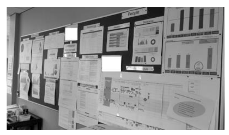
Figure 3: A Type II cell board comprised of three sections; team KPIs (left), a continuous improvement section with the 3Cs (centre) and the people (Human Resources) section (right)