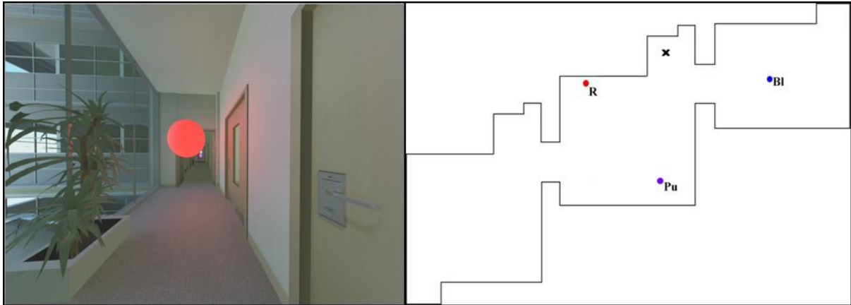
Figure 1. Left panel, screen capture of virtual environment. Right panel, example of possible layout of landmarks on route.