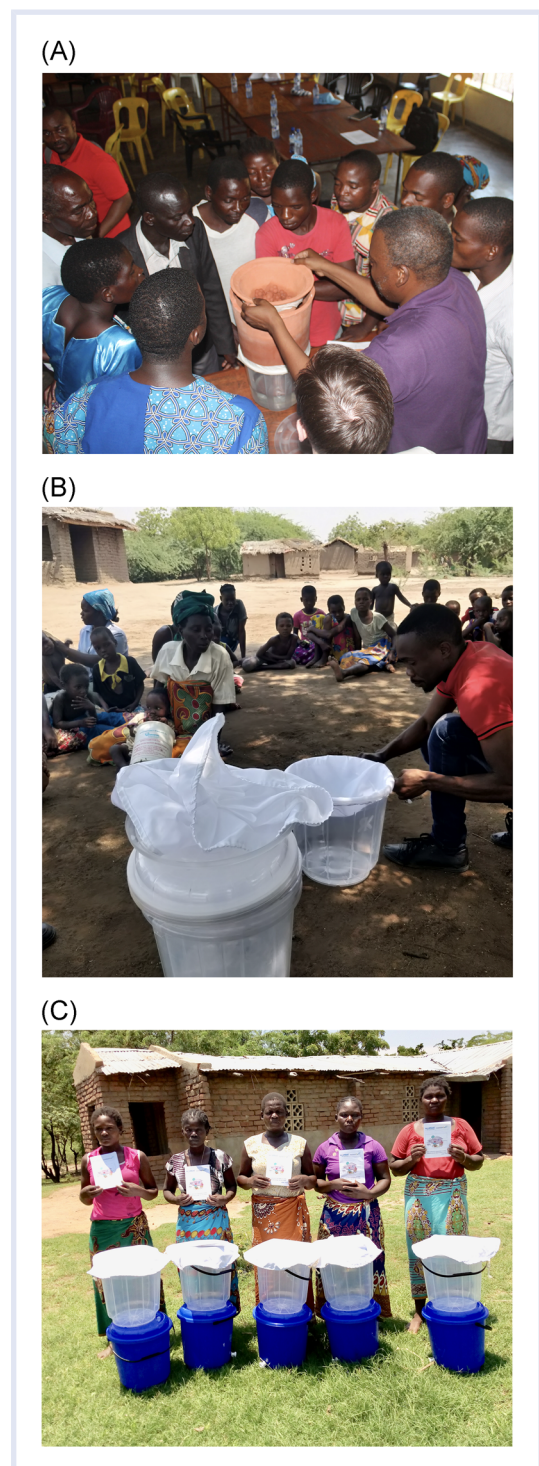
Figure 2. Community dialogue to assess final prototype design: Demonstrating first iteration of combined system (May 2017) (A); demonstrating alternative cloth filter pretreatment (September 2018) (B); participants for Trial of Improved Practices (TIPs; December 2018) (C).

They also highlighted specific examples the difficult task of changing gender norms around household water management: “Men use culture as an excuse for why women must collect water, although men are more likely to contribute to water collection if it is far away and they can use a bicycle for collection”—Water Monitoring Assistant. “We can ask our husbands to buy chlorine, but they may