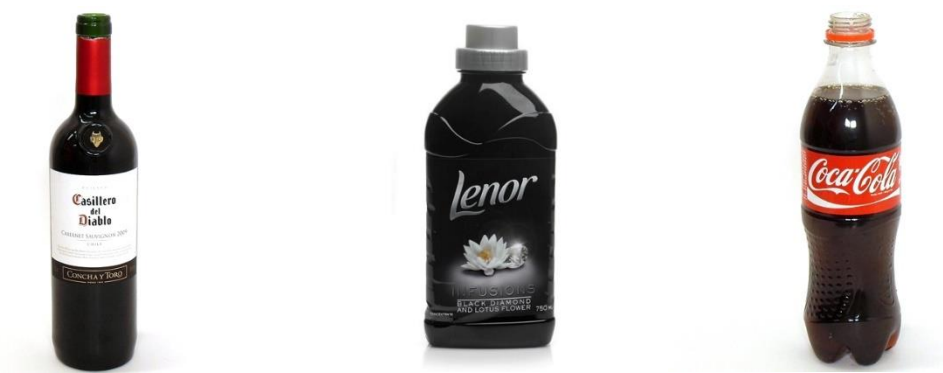
Figure 1. Examples of (L-R) appetitive alcoholic, non-appetitive and appetitive non-alcoholic stimuli

The main task was a gaze contingency task which was run on an EyeLink Desktop 1000 eye-tracker, and designed using Experiment Builder (SR Research). This built on the study designed by Wilcockson and Pothos (2015) 1 and introduced participants to three categories of visual stimuli; alcoholic appetitive, non-alcoholic appetitive, and non-appetitive cues (see Figure 1 for examples). In this task, a fixation target was presented on-screen and participants were required to always look this and not at distractor stimuli. Distractor stimuli were presented within any one of eight regions presented on the computer screen (see Figure 2). These were classified as either ‘central’ distractors positioned close to the fixation target or ‘peripheral’ distractors positioned further away (see Figure 3). The fixation target and distractor stimuli were designed to be equally visually salient.