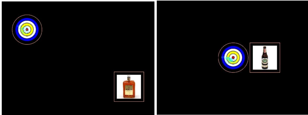
Figure 3. Examples of peripheral (L) and central (R) distractor stimuli (borders = areas of interest).