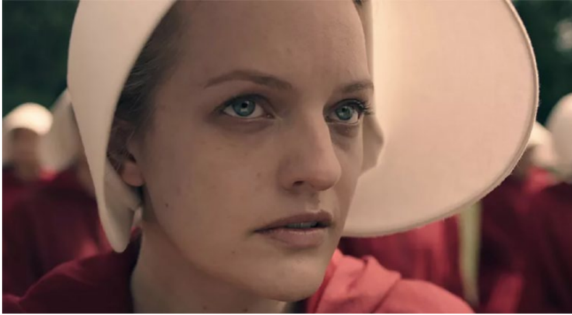
Figure 2. Shallow-focus shot from episode 1, 'Offred', (MGM and Hulu 2017).

the scene (see Figure 1). 2 Doors and windows also frequently form the centre point of a scene, which helps foreground the central themes of imprisonment and surveillance that run throughout the series (see section 5.2).