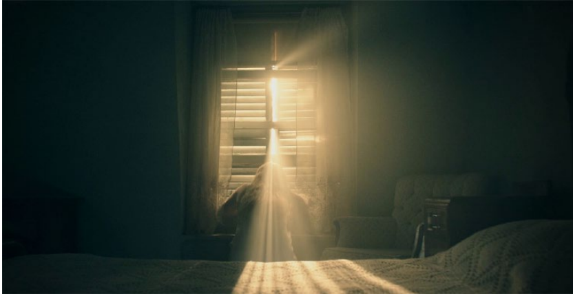
Figure 1. Symmetrical composition from episode 4, ‘Nolite te bastardes carborundorum’, (MGM and Hulu, 2017).

thing?’), 4.8), or a way of signposting the introduction of a flashback (‘She comes to me so clearly in the bath’, 1.10). This happens most frequently in episode 4, ‘Nolite te bastardes carborundorum’. 1 In this episode, June/Offred has been banished to her room and has not been allowed to leave the house for some time due to a fall-out with Serena. June/Offred becomes frustrated and depressed, calling up past memories as a means of coping with her present reality. In contrast, particular episodes have significantly fewer voiceovers, and this occurs when the episode departs from June/Offred’s focalisation: episodes 6 (‘A Woman’s Place’) and 7 (‘The Other Side’), for example, are centred on Serena and Luke’s backstories, respectively, and feature only one voiceover from June/Offred in each episode.