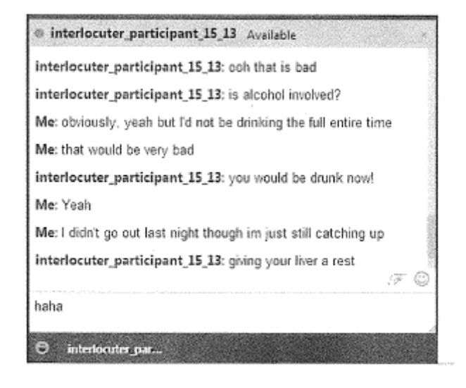
Figure 1: Yahoo! Messenger