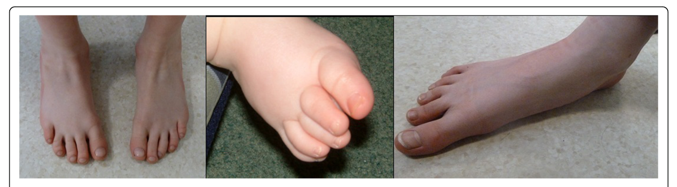
Fig. 3 Minor limb malformations Seen After VPA exposure. Note the hypoplastic and overlapping toes and flattening of the arches due to the joint laxity frequently seen in FVS

at 6 and 18 months [71]. Whilst further evidence is required, currently breastfeeding should be encouraged [72]. A thorough neonatal baby check [67] is essential after birth because of the higher risk of both major and minor malformations. Particular effort should be made to visualise the palate, to check for limb defects, most common involving the radial rays [42-46], to check the spine, and to note any dysmorphic facial features (Listed in Table 4) which are often very recognisable in the neonate. Pronounced ridging of the metopic suture with trigonocephaly [12, 76, 77] may indicate craniosynostosis which will require a referral to a craniofacial team. The risk for malformations of the genitourinary (GU) tract and the heart is increased. Though septal cardiac defects are more common, in some instances very complex congenital heart defects, which may be difficult to detect in neonates, may be present [94] and so one-off scans of the renal tract and the heart should be arranged after birth. Infants exposed to VPA have a significantly increased risk for neural tube defects, most of which will