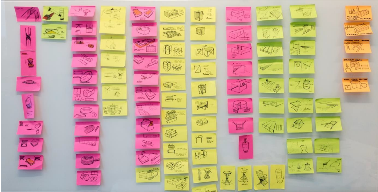
Figure 1. Display of sketch-driven brainstorming for all countries using Post-its