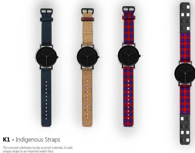
Figure 2. Example of craft produced watch straps proposals for the Kenya sub-brief