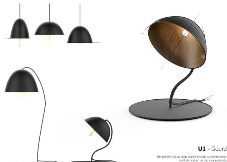
Figure 5. Example of lighting options using a gourd for the Uganda sub-brief

Concept generation resulted in a range of proposals that included a ceiling lamp with matching floor lamp; a modular uplighter/down-lighter/task lamp system; and opportunities to use a gourd as a unique lampshade through a range of lighting options. One of the three developed proposal for the Uganda sub-brief can be seen in Figure 5.