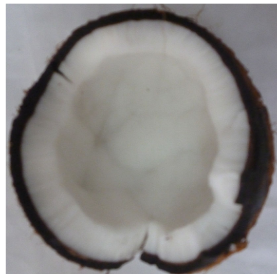
Fig. 3 Coconut seed interior