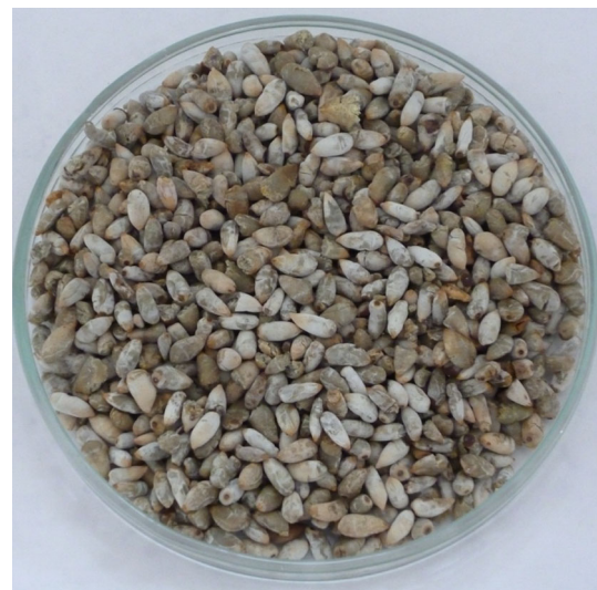
Fig. 2 Upland cotton seeds

The dry sample (100 g) was submitted to an oil extraction process using hexane as a solvent. The solvent was recovered by a rotary evaporator. The concentrations of crude oil obtained were 77.88 % for cashew and 75.63 % for cotton. The coconut seed was grated and the