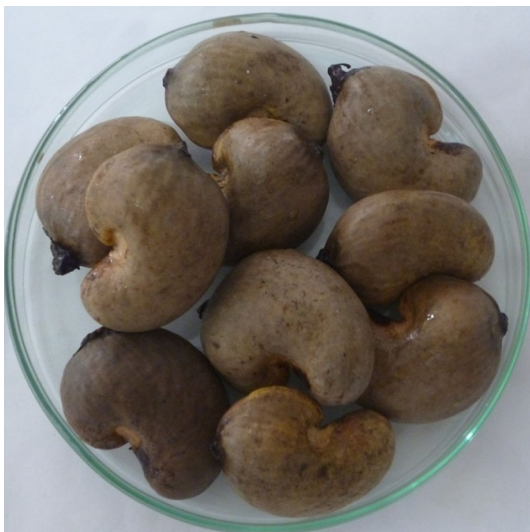
Fig. 1 Cashew seeds

All solvents used in this work were of analytical grade, manufactured by Merck, distilled at reduced pressure before use. The tested samples were seeds of cashew (Fig. 1), upland cotton (Fig. 2) and coconut (Fig. 3), the plants of which were grown at the location of Montería, in Córdoba, Colombia.