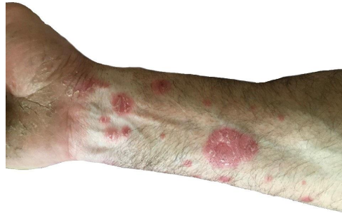
Figure 1. Psoriatic lesions on the inner surface of the forearm.

In experimental studies 15 patients (11 men and 4 women, 47 \pm 15 years, Orel Regional Dermatovenereological Dispensary, Orel, Russia) participated. All patients had a diagnosis of plaque psoriasis of the stationary stage. The study included patients who had plaques on the inner surface of the forearm (Figure 1).