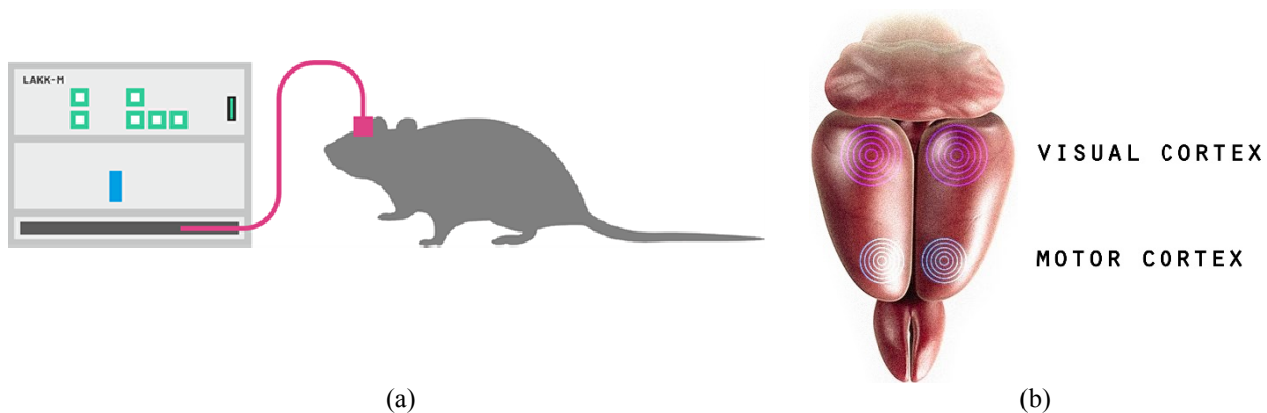
Figure 1. Experimental equipment: scheme of the "LAKK-M" device (a) and the areas of cortex observation (b)

For the detection of fluorescence signals, excitation at 365 nm and 450 nm was used, which corresponds to the excitation wavelengths of the NADH and FAD. The fluorescence spectroscopy system with fibre-optical probe "LAKK-M" (SPE "LAZMA" Ltd, Russia) was used for the in vivo measurements (fig.1 a). The system provides multiwavelength excitation, detects emission, and processes the fluorescence signal. Its light sources include fluorescence excitation in UV (wavelength = 365 nm, power = 1.5 mW), blue (wavelength = 450 nm, power = 3.5 mW) and green light (wavelength = 532 nm, power = 4.5 mW). The abovementioned fluorescence excitation powers are provided at the tip of fibre probe, which induces an excitation light flux in the tissue of no more than 0.16 W m -2 for 365 nm and 0.37 W m -2 for 450 nm. The spectrometer was a polychromator with a diffraction grating, and a CCD (TCD1304AP, Toshiba, Tokyo, Japan) was used as the detector.