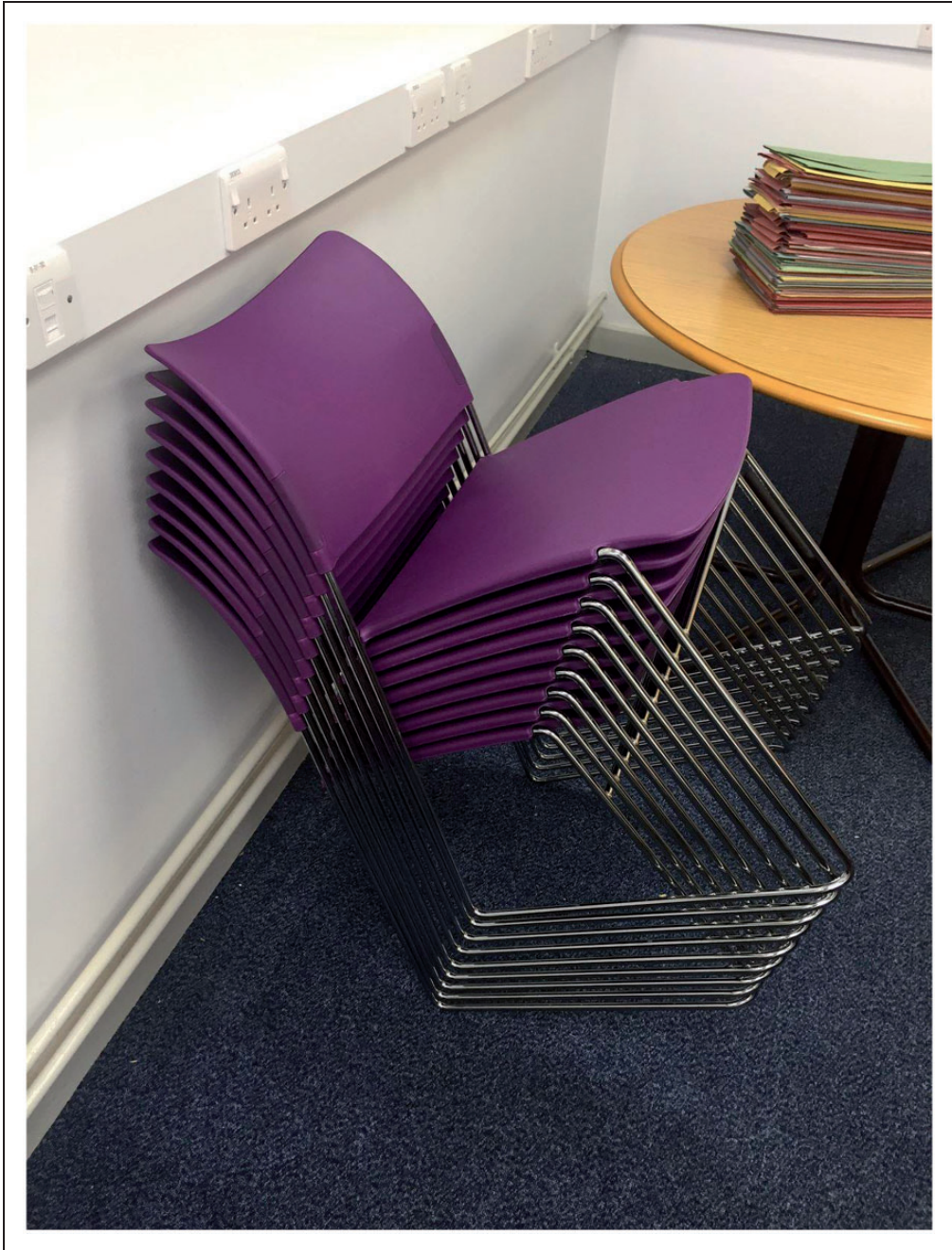
Figure 1. The stacking chairs.

The stimulus superficially calls to mind the Penrose triangle (Penrose & Penrose, 1958), the critical difference between the two being that the latter has no real-world interpretation (it is a paradoxical figure, and geometrically impossible), whereas the former does: A, B, C, D, E and F all being in roughly in the same vertical plane. But the misleading local three-dimensional