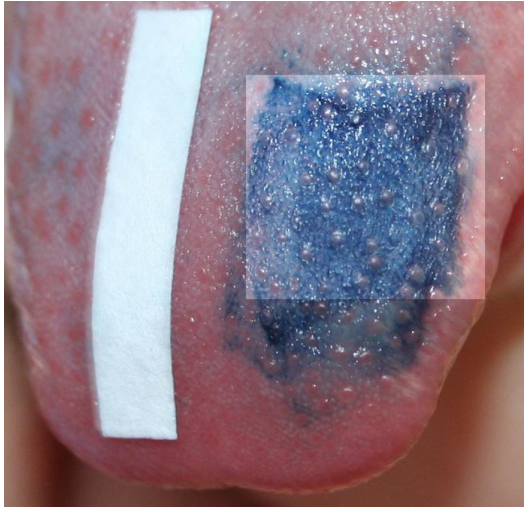
219 Fig 1. Example photograph with image adjustments to ease analysis.