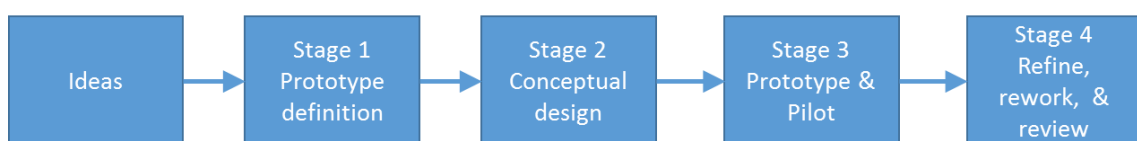
Figure 2: Game development methodology applied in this research