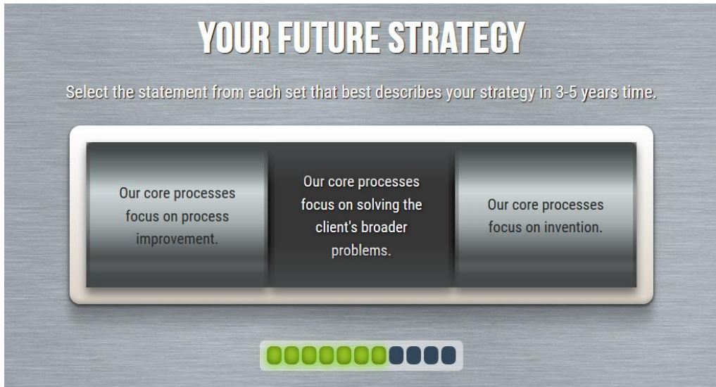
Figure 4 – Unlock Your Insight combination lock