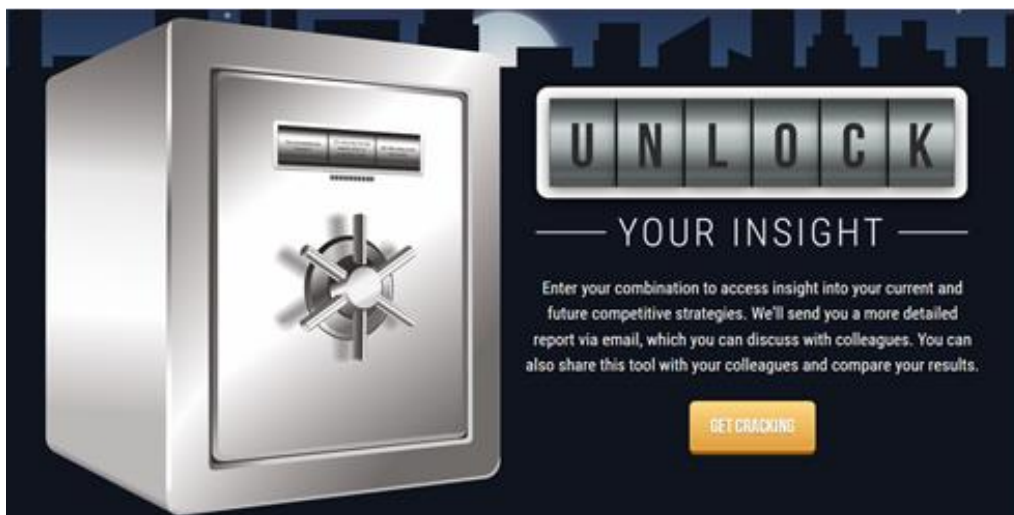
Figure 3 – Unlock Your Insight title screen

Unlock Your Insight was the outcome of following this process. As illustrated in Figure 3, the premise of Unlock Your Insight is that the user needs to unlock a safe to reveal their competitive strategy. The combination lock of the safe combines the activities of statement selection with design considerations for mobile devices; encouraging users to continue through the statements by using rotating dials and lights to indicate progression (see Figure 4). This progression is rewarded through visual feedback of responses (see Figure 5) and an emailed report of the results. Though other scenarios were considered that contained a similar sequence, such as opening a treasure chest on a sunken ship, opening a safe was considered more appropriate for our target users, and the feedback mechanisms could be more easily associated with the dials on a safe.