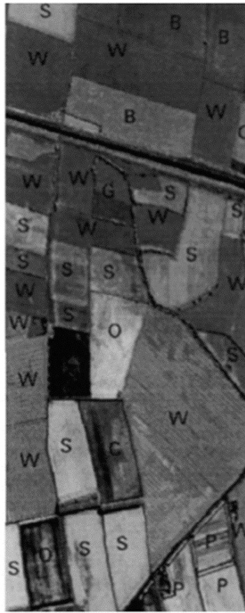
Figure 2. Extract of the ATM data, in 0.60–0.63 \mu\text{m} waveband, with class type annotated.

To simplify the analyses and aid the acquisition of sufficient training data, only the data acquired in three wavebands, those located at 0.60–0.63, 0.69–0.75, and 1.55–1.75 \mu\text{m} , which had been identified in earlier studies (e.g., [38]) as providing a high degree of class separability, were used. Here, attention focused on the six crop classes that dominated the region at the time of the ATM data acquisition: sugar beet (S), wheat (W), barley (B), carrot (C), potato (P), and grass (G). Following the widely used 30p heuristic, where p is the number of discriminating variables that is often used with statistical classifiers [39], a training set comprising at least 90 cases for each class was required. Here, a total of 100 pixels of each class were randomly obtained from the ATM data and used to form a training set ( n = 600 ). This initial training set is balanced, with each class equally represented, and was taken to be perfect or error-free. The location of the six classes in the three waveband feature space is shown for these training data in Figure 3.