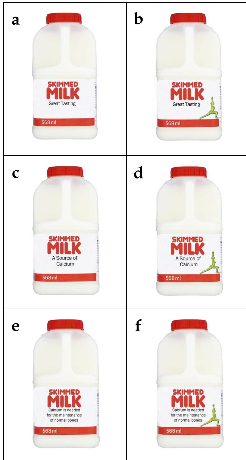
Figure 1. Examples of packaging used in Experiment 3, with generic claims (panels a and b), nutrition claims (c and d), and health claims (e and f). Exemplars in the left column represent the image-absent condition; those in the right column the image-present condition. In this case the corresponding function image is a stretching human figure with bone illustration.