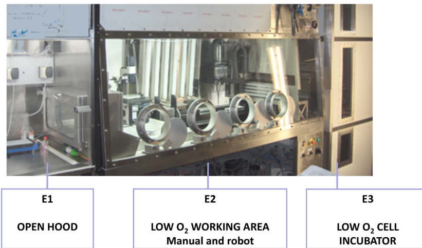
Fig. 2. Low oxygen cell culture platform.

that the mean oxygen level experienced by T cells varies from 1% to 10% according to their localization (Larbi et al., 2010). Culturing T cells at physiological oxygen concentration (5%) generates cellular responses closer to those detected in vivo (Atkuri et al., 2007). In order to detect new biomarkers of T cell ageing, we studied gene expression changes following activation of T cells cultured under atmospheric or physiological oxygen pressure.