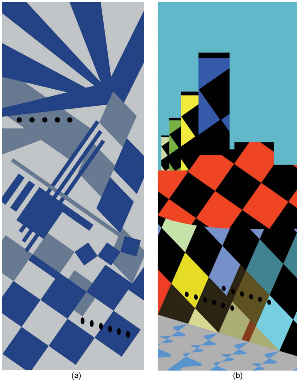
Figure 4. The door to misperception: Abstract expressionist artwork (2011) inspired by the dazzle camouflage of RMS Mauritania, printed on each side of a domestic internal door. (a) An image inspired by (i) the different dazzle patterns found on the two sides of the ship, (ii) the painting by Burnett Poole (Figure 2), and (iii) a model constructed by Jim Baumann (not shown). (b) The “sunset” colors were inspired by those found in the Cunard Line publicity poster (Figure 3a) in an image that also pays homage to the cubist art period of the time (note the orthogonal directions of travel implicit in the superstructure). (Copyright held by the author/artist.)