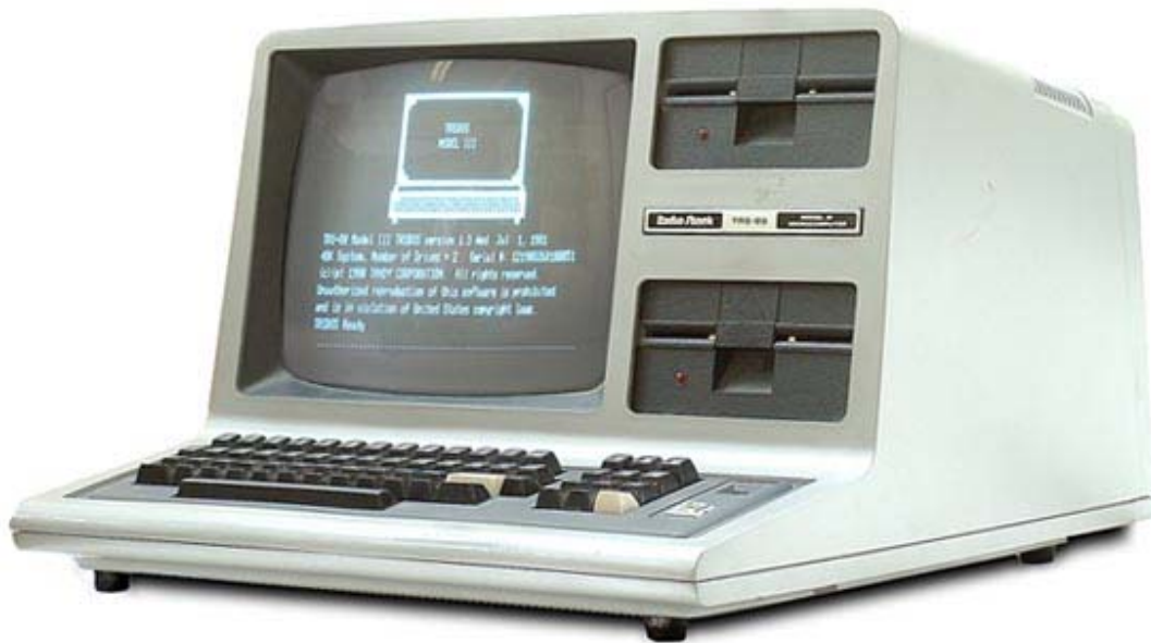
Figure 1 Tandy TRS-80 Computer Circa 1980

The Tandy TRS-80 was originally introduced in 1977 and used cassette tapes to store data. Sold through Radio Shack stores, the first model racked up sales of 10,000 in the first month at $600 each. Pictured above is the TRS-80 Model III, which was introduced in 1980 and employed two 8 inch floppy disk drives (touted at the time as a revolutionary breakthrough) – one for the program files and one for storage. There was no hard drive.