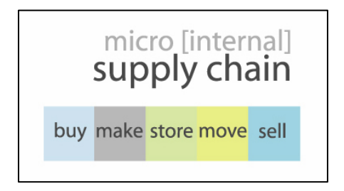
Figure 2 –Integrating the Internal Supply Chain

Traditionally these functions have been managed in isolation, often working at cross purposes. SCM means thinking beyond the established boundaries, strengthening the linkages between the functions, and finding ways for them to pull together. A recognition that the "whole is greater than the sum of the parts" calls for more effective integration between purchasing and procurement (buy), production planning and control (make), warehouse management (store), transport management (move) and customer relationship management (sell), as illustrated in Figure 2.