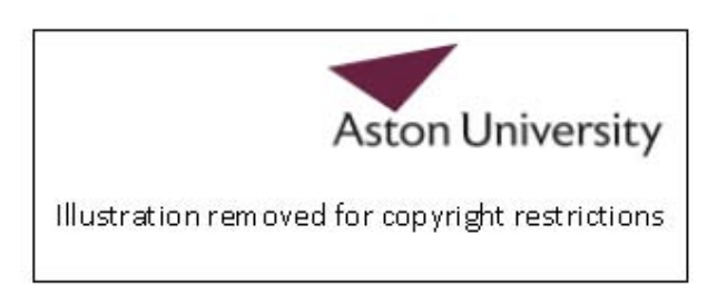
Figure 3-2: Proportion of households with Internet access arranged by region

At continental level, the following diagram demonstrates that the continent of Africa has the lowest Internet access rate by household right after Arab states.