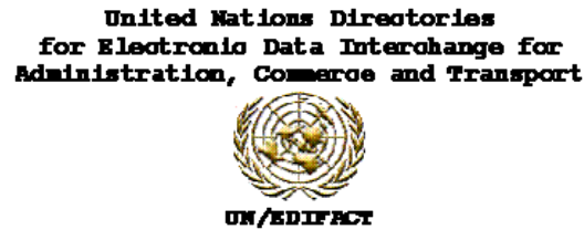
Figure 2: Extract of cover page from EDIFACT ENTREC Message (size reduced)