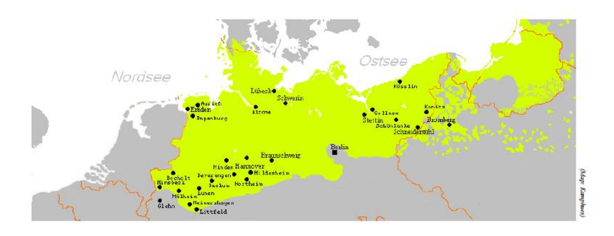
Map 1: LCAAJ interviews in the Low German-speaking areas

Secondly, the map indicates that speakers came not only from villages and small towns, but also from larger towns such as Schwerin, Stettin, or Lübeck, and cities such as Hanover. Table 2 shows the overall population numbers of the LCAAJ informants' places of origin, according to the census of 1925. On the basis of the LCAAJ interviews, in the Low German-speaking areas remnants of Western Yiddish were known in eight villages with a population larger than 1,000, in eleven towns with more than 10,000 inhabitants, and in six cities with more than 100,000 inhabitants. Thus, the LCAAJ fieldwork questionnaires show that knowledge of remnants of Western Yiddish was not restricted to rural or smaller Jewish communities.