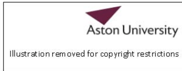
Figure4.6: Map of land swap as published by Ha'aretz newspaper

In figure (4.6), the map confirms the political message in the summary of the Accord distributed to the Israeli public, namely, ‘Greater Jerusalem under our sovereignty’. In this sense, visual images play a decisive role in advancing political agenda and propaganda of the Israeli side of the initiative.