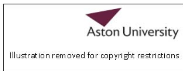
Figure 4.1: Cover of the Hebrew Translation of the Geneva Accord

The cover of this booklet is particularly interesting. The first aspect is the choice of colour scheme. The white and blue colour scheme presents the accord in a nationalistic and patriotic frame. These are the colours of Israel's flag and had been deliberately chosen to appeal to the general Israeli public. The second aspect is the very careful choice of text imprinted on the cover. The cover has a blue strip surrounded by white space and is divided into two parts by the title in the middle. The title says 'Geneva Initiative: A Model for an Israeli-Palestinian Final Status Agreement'. The blue strip quotes a number of the selling points of the initiative from its summary. The most eye-catching points are the recognition of Israel as the state of the Jewish people, and Jerusalem as the capital of Israel, and the promise that most of the Israeli settlers will remain in the territory of Israel.