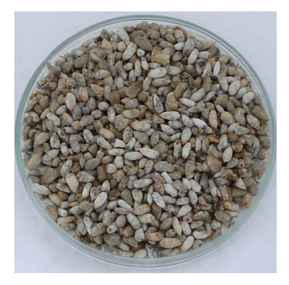
Fig. 2 Upland cotton seeds

The dry sample (100 g) was submitted to an oil extraction process using hexane as a solvent. The solvent was recovered by a rotary evaporator. The concentrations of crude oil obtained were 77.88 % for cashew and 75.63 % for cotton. The coconut seed was grated and the