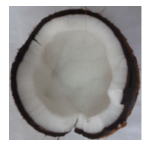
Fig. 3 Coconut seed interior