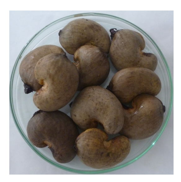
Fig. 1 Cashew seeds

All solvents used in this work were of analytical grade, manufactured by Merck, distilled at reduced pressure before use. The tested samples were seeds of cashew (Fig. 1), upland cotton (Fig. 2) and coconut (Fig. 3), the plants of which were grown at the location of Montería, in Córdoba, Colombia.